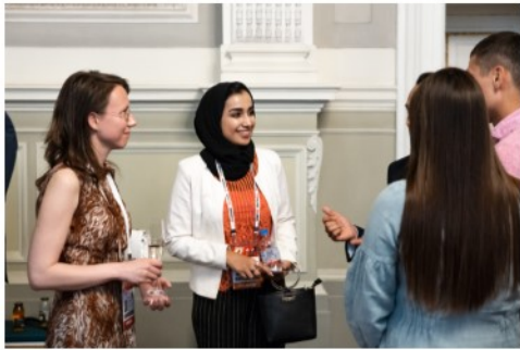
Delegates and volunteers of the 6th WPC Youth Forum