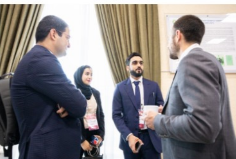
Members of YP Committee