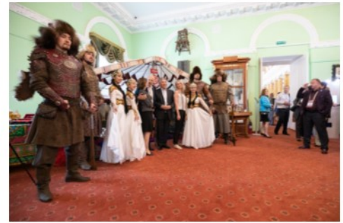
Anatoly Zolotukhin, Uzakbay Karabalin and Kazakh national artists